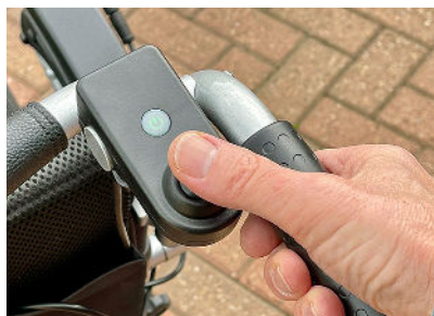
Attendant Control Kit