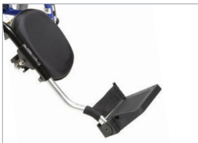
Individual Elevating Legrests