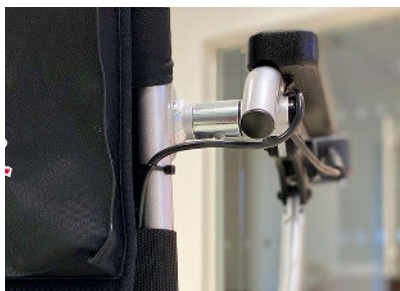
Seat Widening Kit