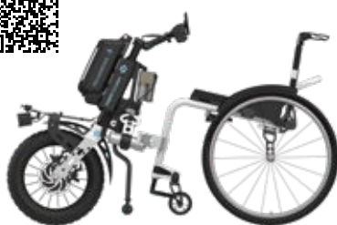
ICON 60 with PAWS