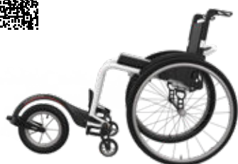
ICON 60 with TRACK WHEEL