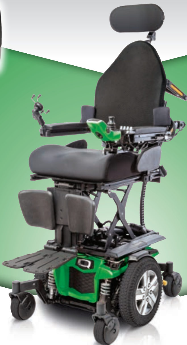
Q6 EDGE® 2.0 shown in Green Machine with 12" iLevel® technology and Q-Logic 3 Advanced Drive Controls with Bluetooth®