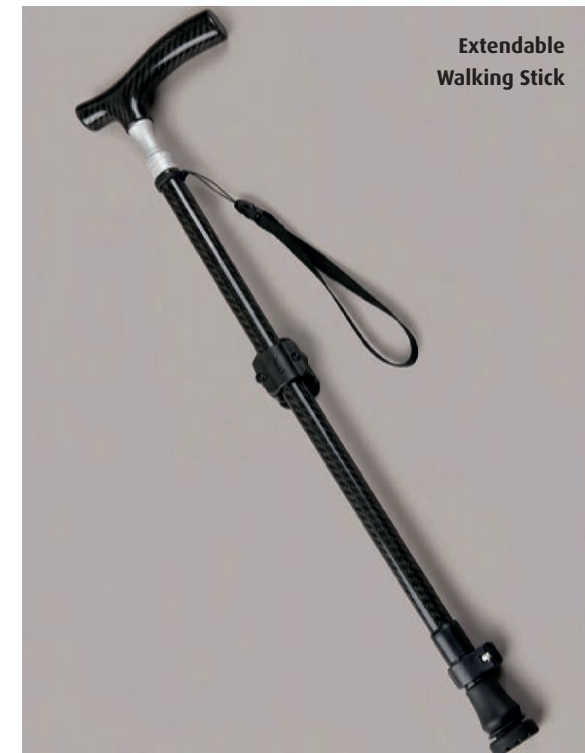
Extendable Walking Stick

Adjusts to fit your phone, tilts for the perfect view and even powers it up on the go with built-in charging.