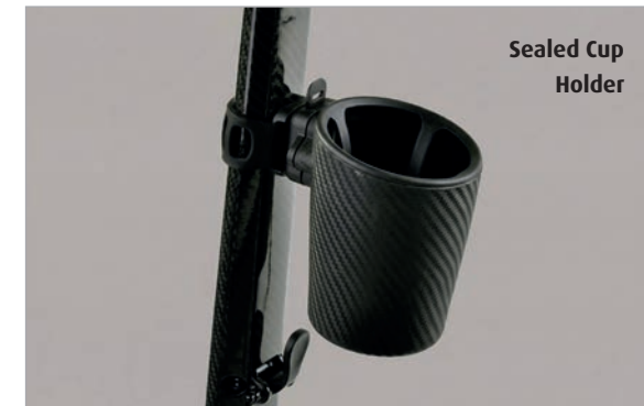
Sealed Cup Holder