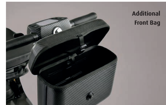
Additional Front Bag