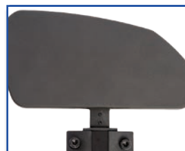
Clothing Guards (Pair)