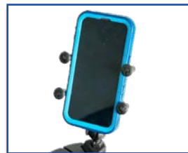
Mobile Phone Holder