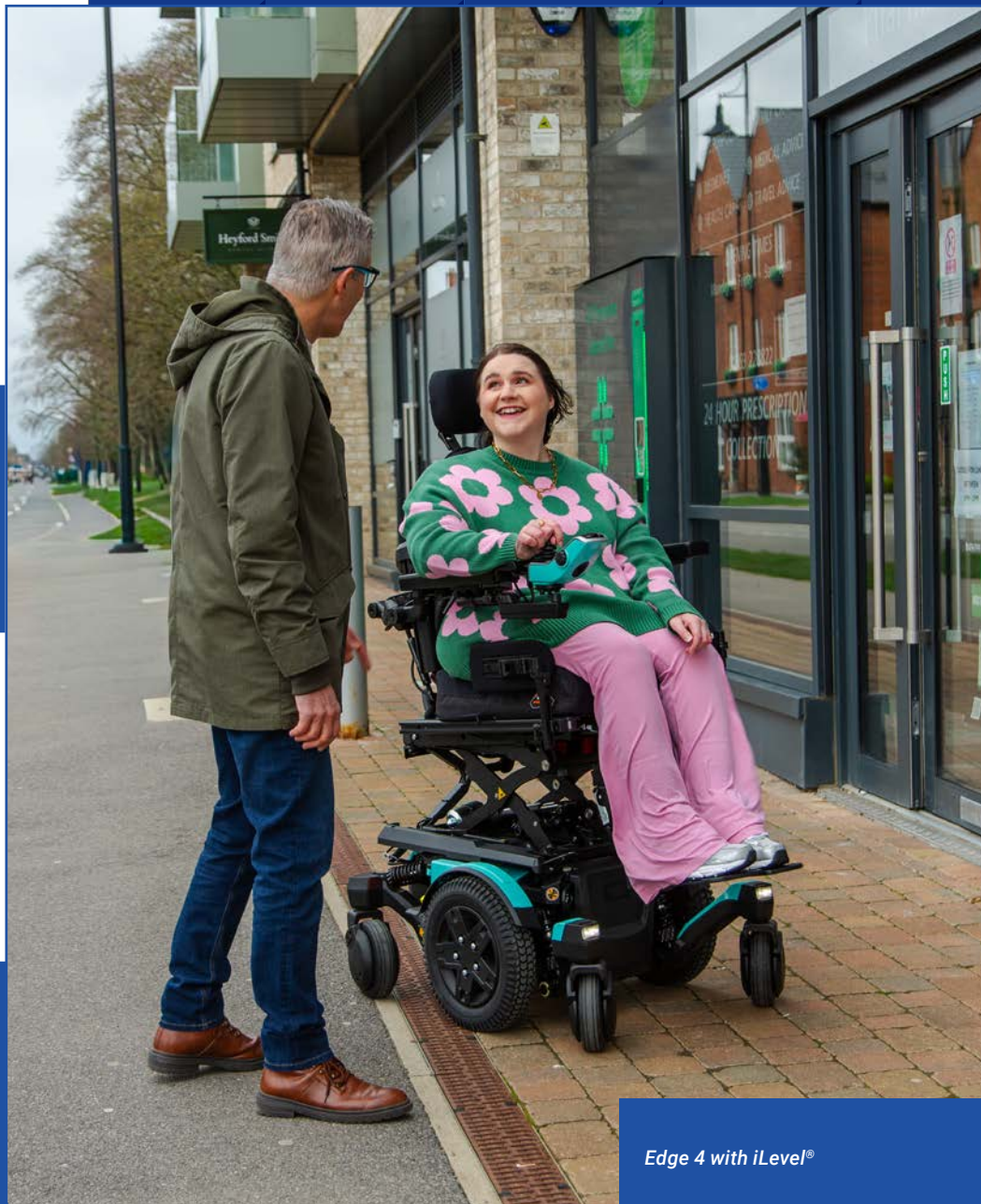
Edge 4 with iLevel®