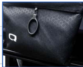
Personal Items Pouch