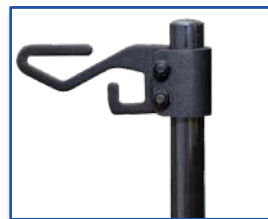
Personal Item Hook

*Accessory compatibility subject to seat type and configuration