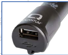
XLR USB Charger